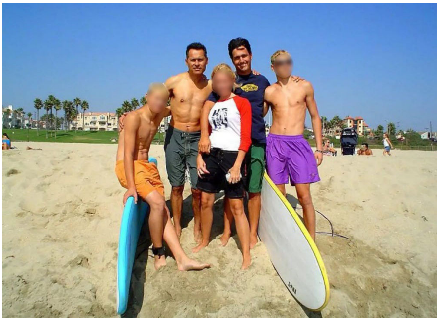
Figure 11: Harvest Homes children in California on the beach with hosts

175. During the Christmas trips, he usually brought children living in the Harvest Homes with him to show them off and elicit more sympathy and money from donors. They considered this a great privilege and he mainly picked his favorites, who were most inured to acceding to his sexual demands.