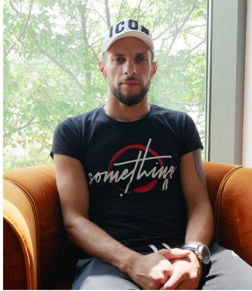
Figure 13: Plaintiff, 2023