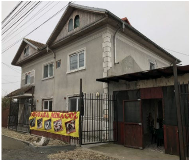
Figure 9: The Buftea home in 2017