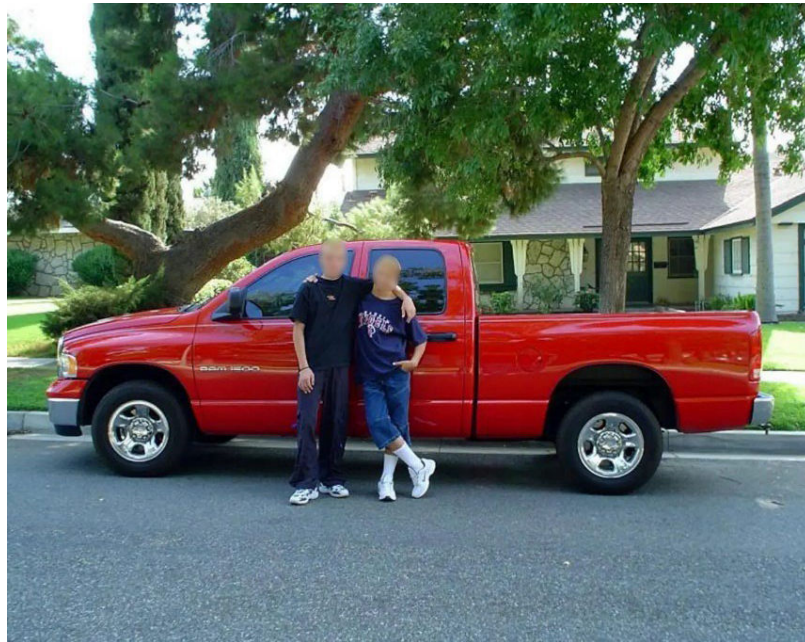
Figure 12: Two Harvest Homes children in California