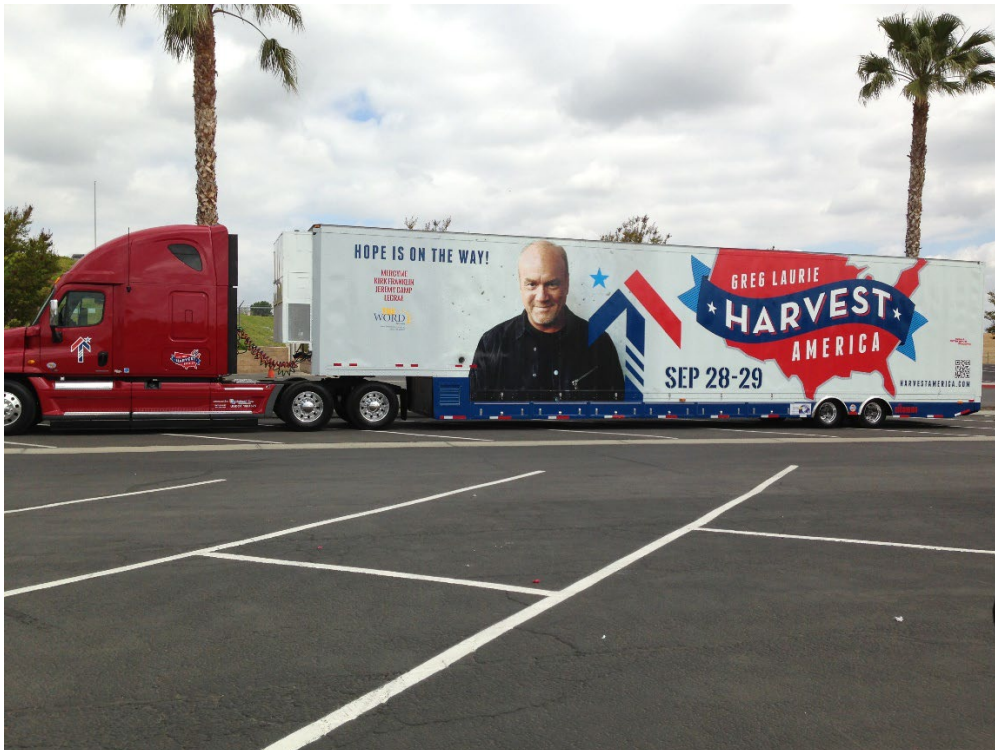
Figure 4: Harvest America tour bus, 2012.

44. Laurie's wood-paneled office is full of pictures of him in the company of important politicians, religious leaders and actors.