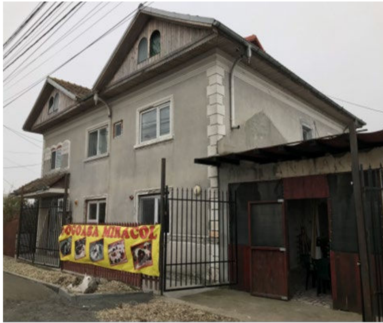
Figure 11: The Buftea home in 2017

111. By 2000, Laurie authorized the purchase of two more homes to house the growing number of children in Havsgaard's care, one in the Dămăroaia district in north Bucharest for housing girls and young boys, and a smaller one in Strada Bârlogeni, mostly for boys.