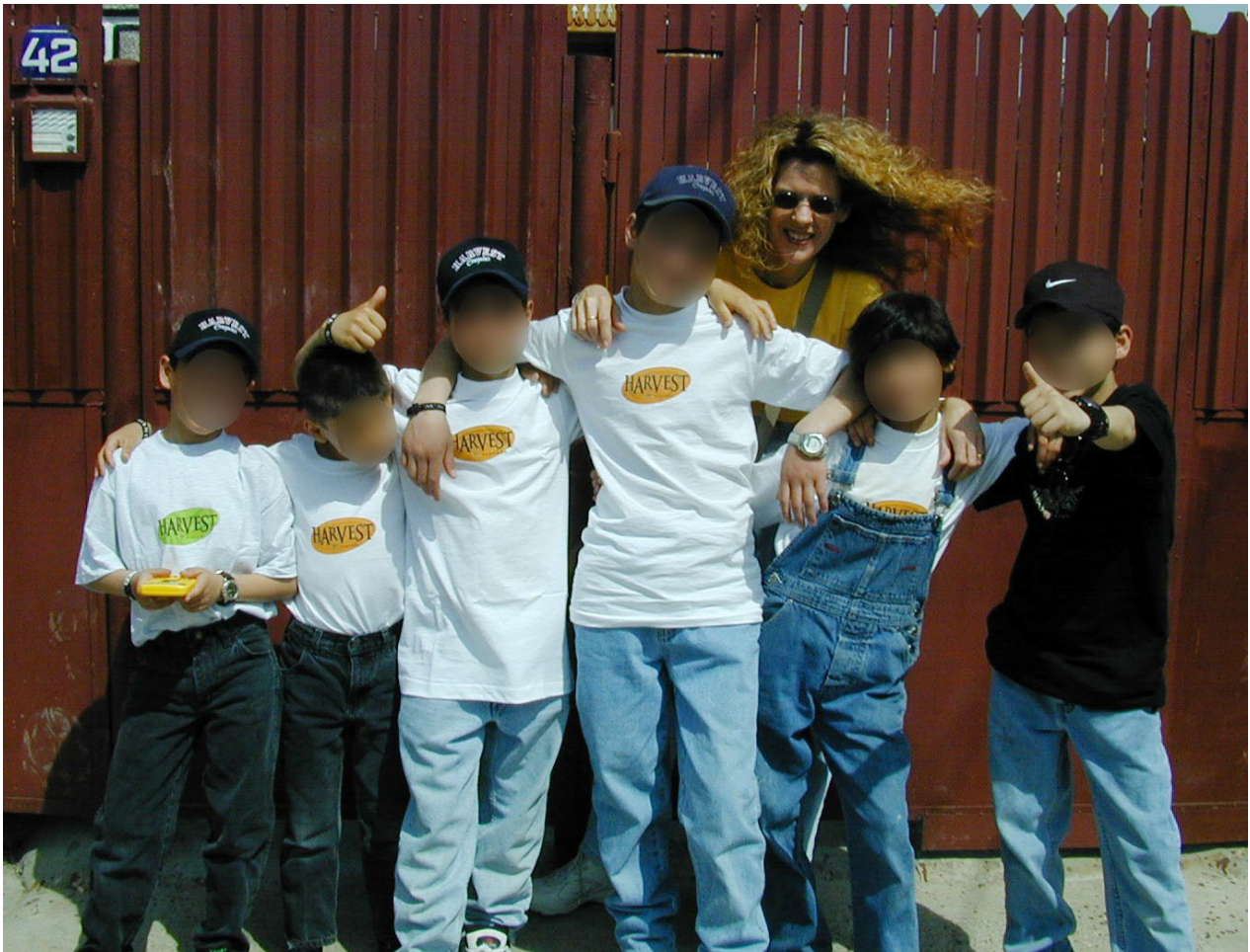
10 Figure 8.a: Kathy and Harvest Homes children 11 wearing Harvest-branded clothes

6 79. The Harvest Homes showed many indicators of being an outpost of 7 Harvest Riverside. They were commonly referred to as being part of "Harvest." The 8 children were given Harvest-branded T-shirts and hats to wear. Visitors and 9 volunteers from Harvest Riverside came to help at the Homes.