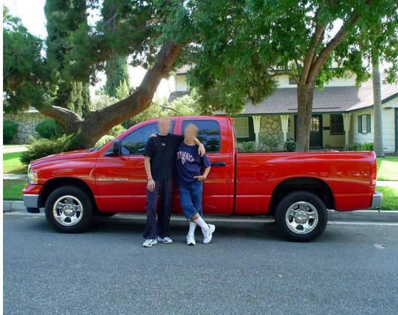
3 Figure 14: Two Harvest Homes children in California