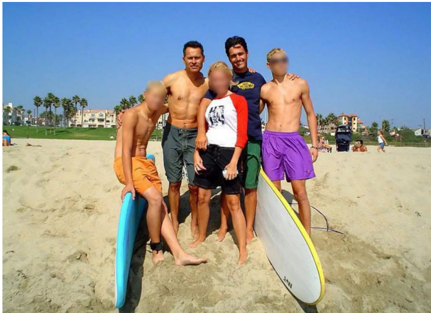
Figure 13: Harvest Homes children in California on the beach with hosts

175. During the Christmas trips, he usually brought children living in the Harvest Homes with him to show them off and elicit more sympathy and money from donors. They considered this a great privilege and he mainly picked his favorites, who were most inured to acceding to his sexual demands.